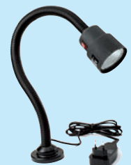
Grinder light that will fit all grinders